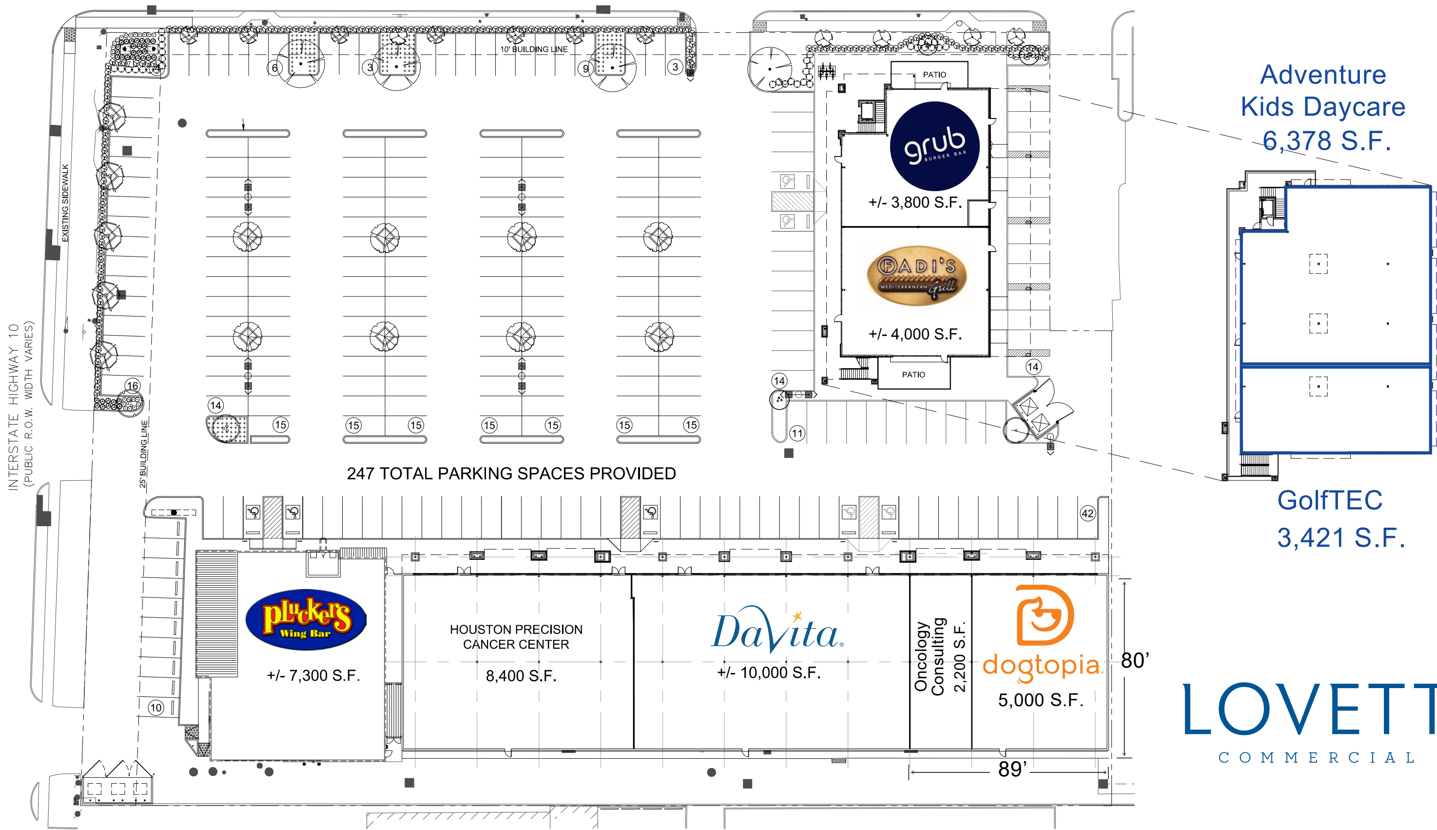
SITE PLAN - LEASING DIAGRAM 1" = 20'